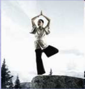
Balance + and -